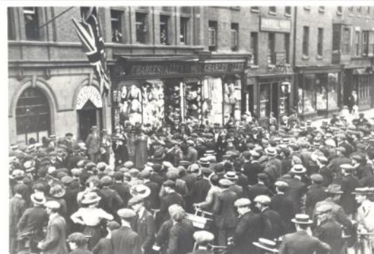
Peterborough Recruitment Office.