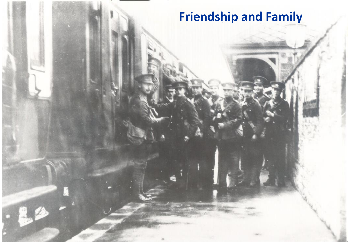
Men of Oundle Leaving for War. From Peterborough Museum (CG127)