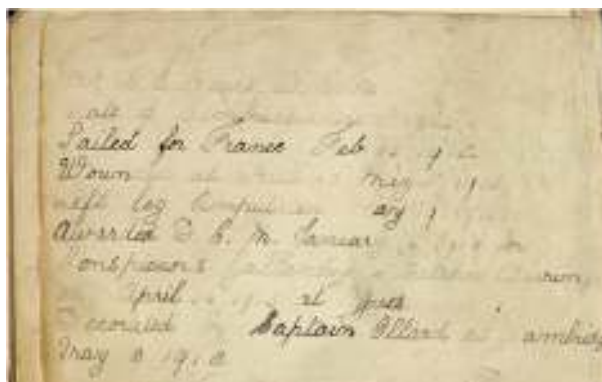
WUTAC visitors' book