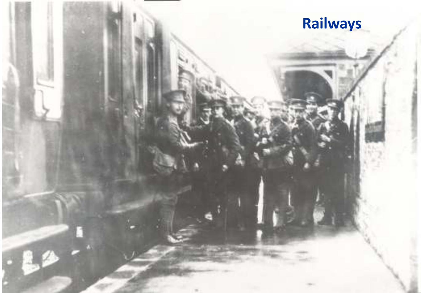
Men of Oundle Leaving for War. From Peterborough Museum (CG127)