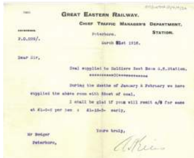
Invoice, From Peterborough Archives & Local Studies (PAS/WUTAC/2/4/4/36)

Portrait of Mr Ellis, From The Great Eastern Magazine , December 1913